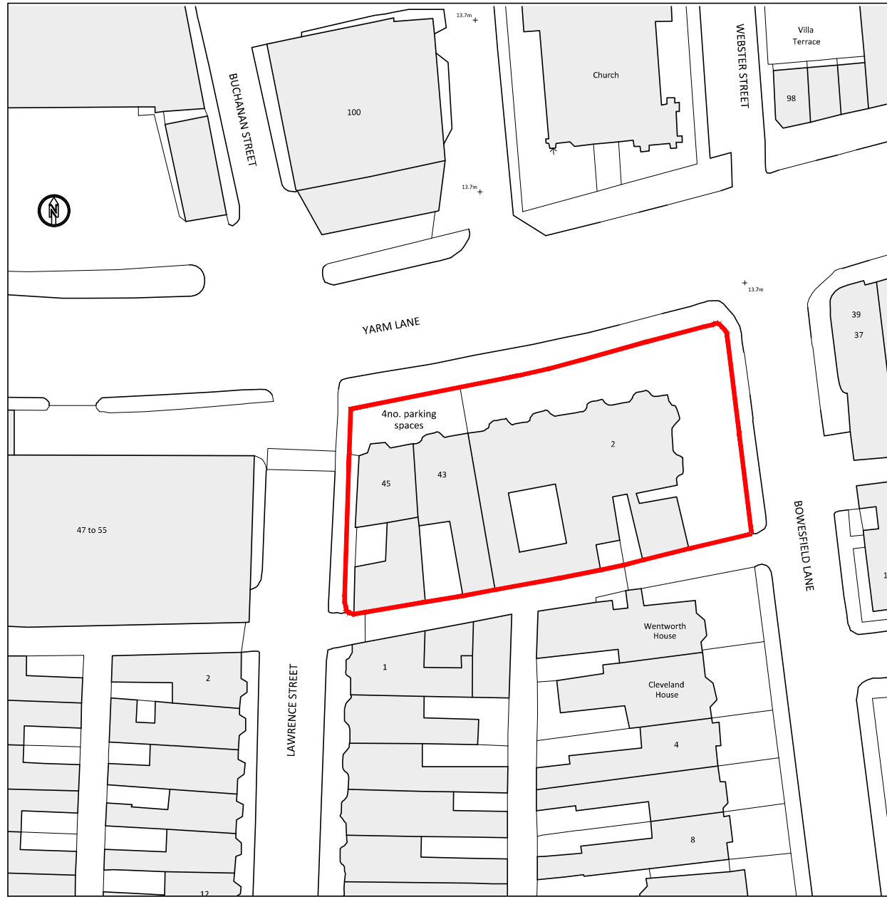
SITE BLOCK PLAN